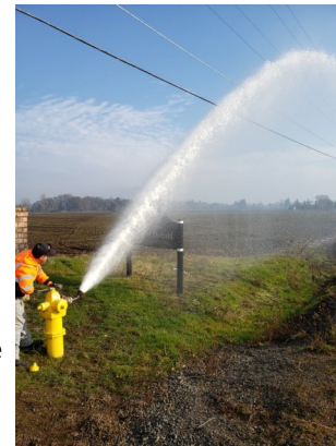
Right: Flushing out of Fire Hydrant